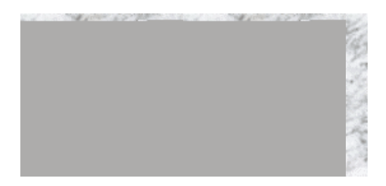
FIGURE 7: GROWTH IN NEGATIVE GEARING OF RENTAL PROPERTIES 1993-94 TO 2000-01 ^{109}