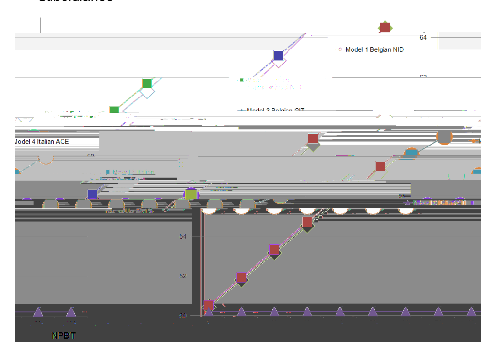
Fig. 2: Results of Modelling a Headline CIT Rate Cut on the Belgian and Italian Subsidiaries

It goes without saying that international tax competition issues cannot be eliminated. However, the findings of this model question whether jurisdictions such as Belgium and Italy would benefit from coordinated multilateral reductions to their CIT rathes. T model assumes that coordination would only occur between high purisdictions; that is, the Belgian and Italian subsidiaries, and the US. The findings are that while TTP behaves in the way illustrated by the abolic 2, the most taxaggressive MNE never nominates to place any NPBT into the Belgian and Italian subsidiarither it channels its profit shifting into the very lowest taxing jurisdictions availate it, ie, specifically, in the context of this model, to Singapore and Hong Kong. This indicates that Belgium DQG, WDO\ZRXOGQRWEHWKH µZLQQHUV¶IURPDFRF