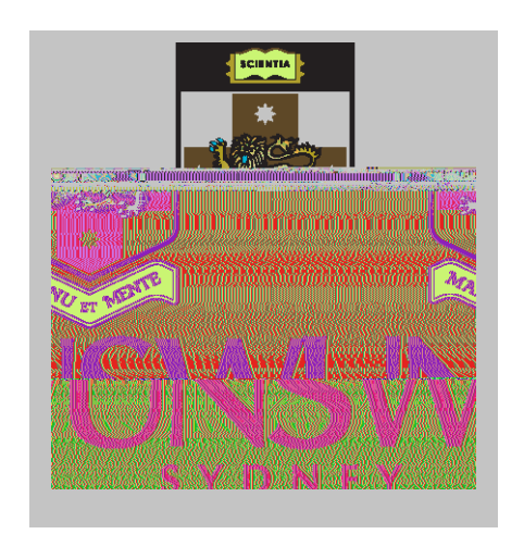
Faculty of Engineering